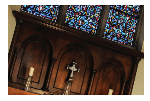
American Bible Society has established the Trauma Healing Institute as part of its long-term commitment to serve the Church and other faith-based organizations as they minister to individuals and communities.